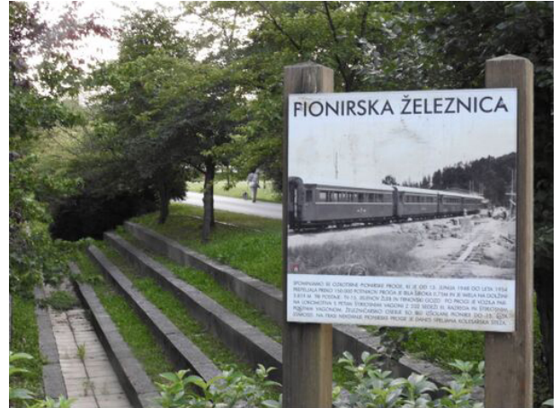
Pioneer Railway (Ljubljana, Slovenia) was in operation only during 1948–54