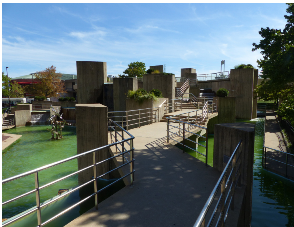
Fountain on McKeldin Square demolished in 2017 (Baltimore, MD, USA)