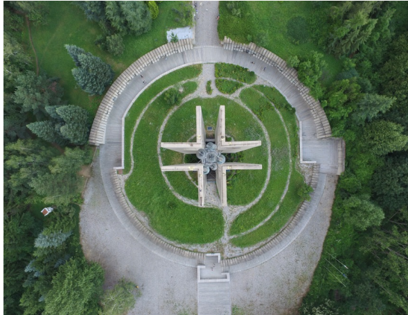
Banner of Peace (Sofia, Bulgaria)