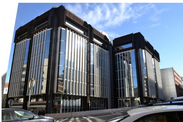
The building of Transgas (Prague, CZ) became the main topic of research for CCEA