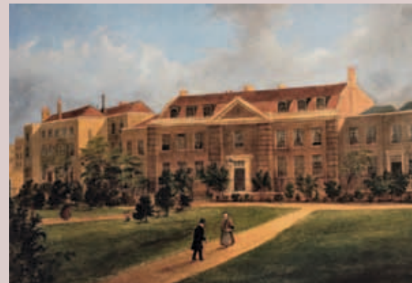
The first French Hospital, Cripplegate, founded in 1718

The French Protestant Hospital in Clerkenwell, 1742