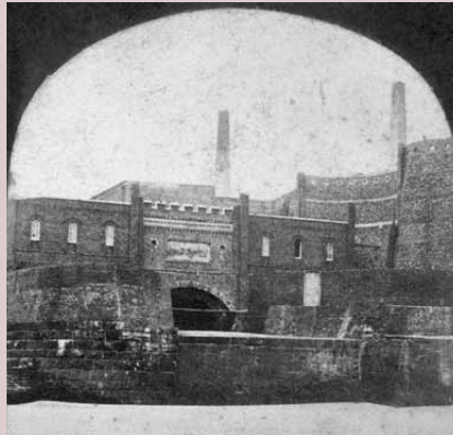
The Clifton Baths at Margate (Historic England)

Health, Architecture and Urbanism in the Early Modern Era: from prevention to treatment