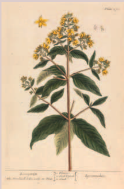
Elizabeth Blackwell, Lysimachia , pl. 78, A Curious Herbal , 1737 (Yale Center for British Art)

'Bedlam's Picture Gallery': Health, Performance, and the Built Environment at Bethlem