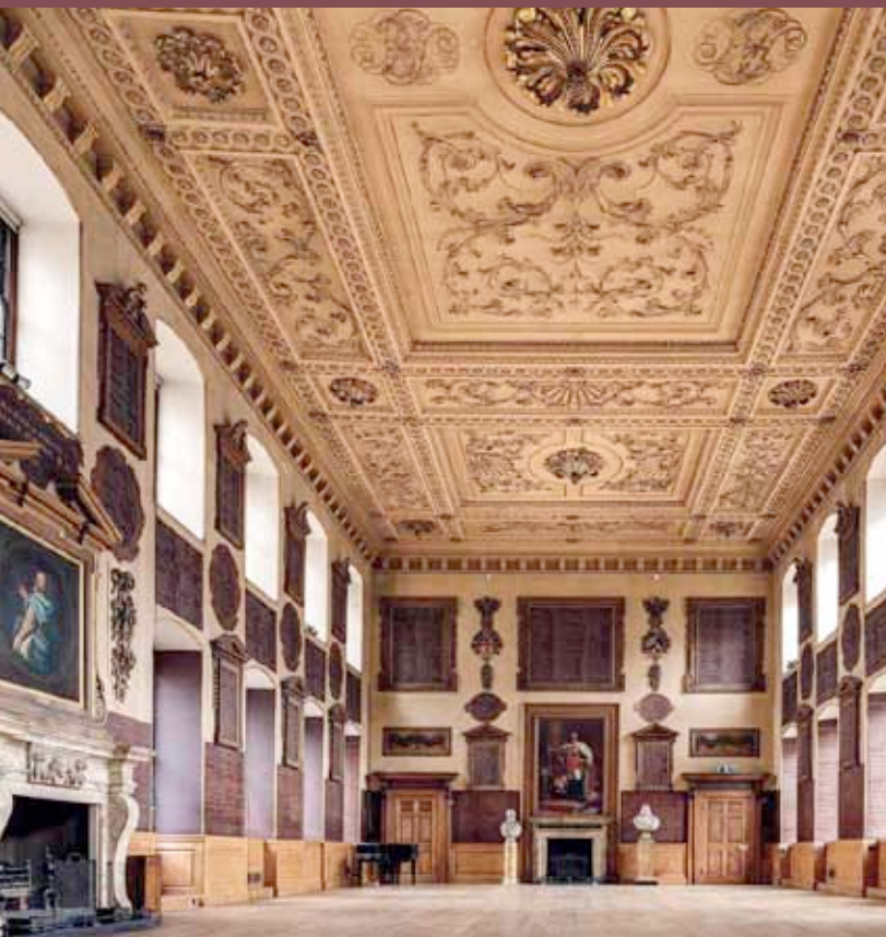
The Great Hall, St Bart's